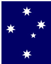
Southern Cross Constellation